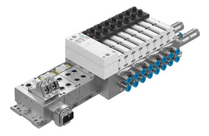
The VTSA-F-CB valve terminal has a modular setup and can be up to 8 metres long when fully configured.

conds to just 3.96 seconds, allowing us to offer user-friendly product configuration on our eCommerce channel.'